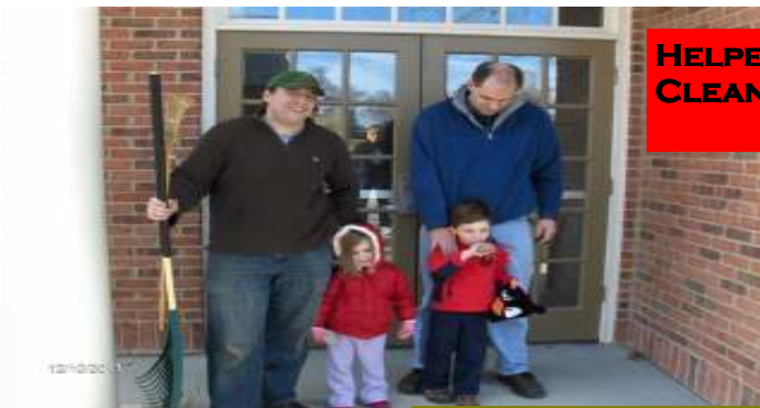
HELPERS AT OUR DECEMBER CLEAN-UP

Mark your calendar and come together with others in living out our faith's call to seek God's justice, joining your small contribution of hours with those of other people of faith to make an IMPACT for our struggling neighbors.